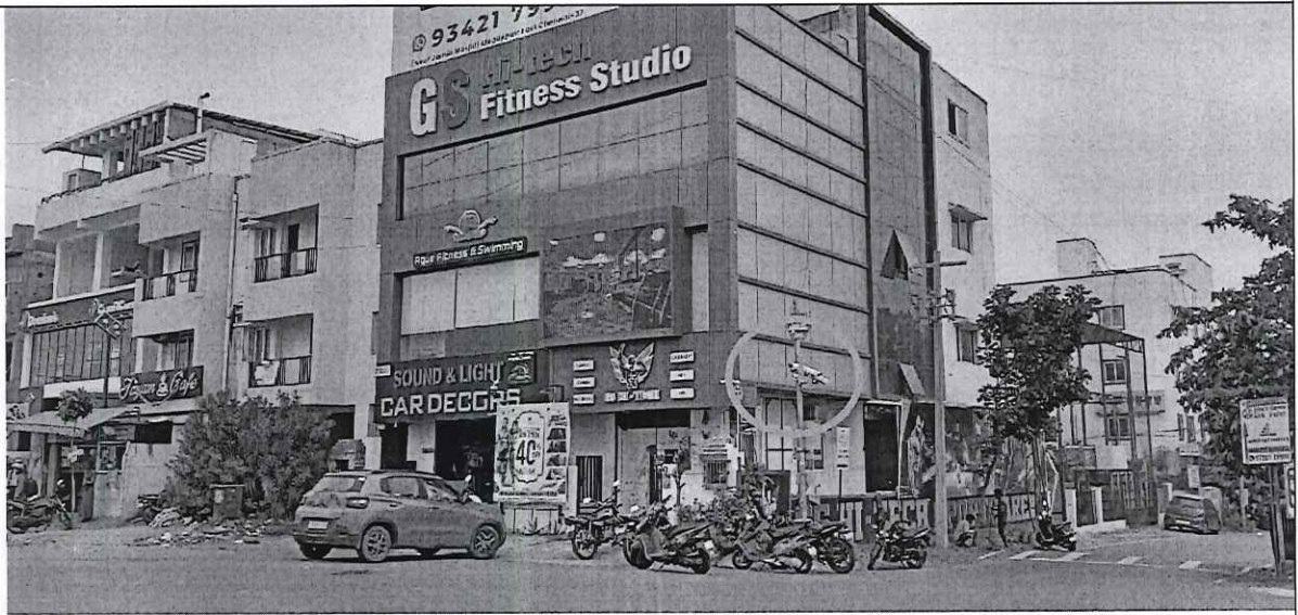
Photographs taken during Inspection